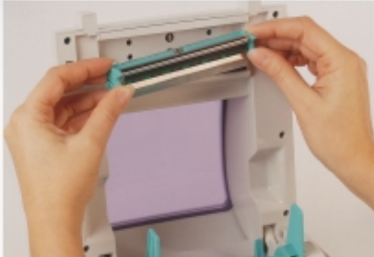
Tool-less replacement of the printhead.

The B-SV4D is a small (200 mm x 231.8 mm) and light (2 Kg/ 4.4 lbs. excluding media & AC adapter) printer which can be installed immediately in any convenient place.